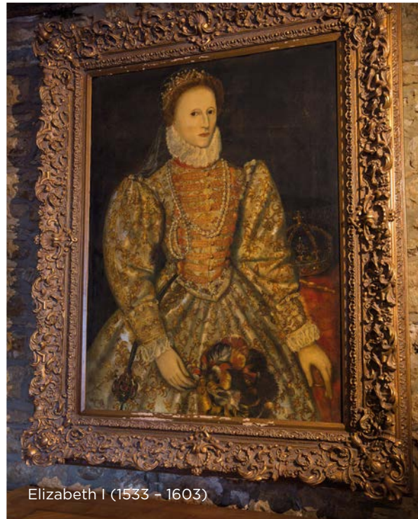
Elizabeth I (1533 – 1603)